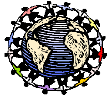
Five Thirty Program